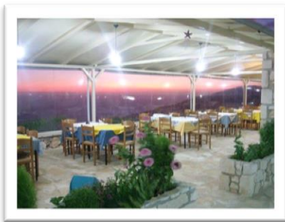
Family run Tavern Aeras

In Porto Vromi you will find a small beach front along with a cafeteria with refreshments and snacks. Interesting is that you can take the small guided boat tours to the "Shipwreck" from there. Recommended especially in the off-season, not necessarily in the high season. The Shipwreck Bay is crowded then.