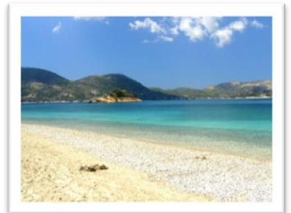
Pebble beach at Marathonisi