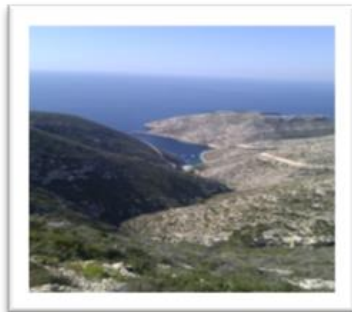
View at the bay from the Tavern