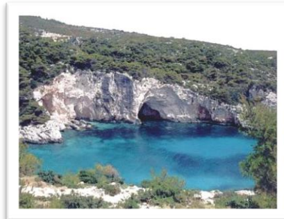
Swimming in cristal clear water Porto Limnionas