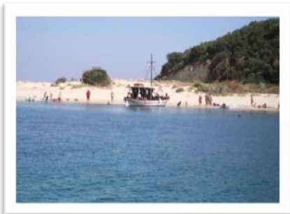
Snorkelbeach at Marathonisi